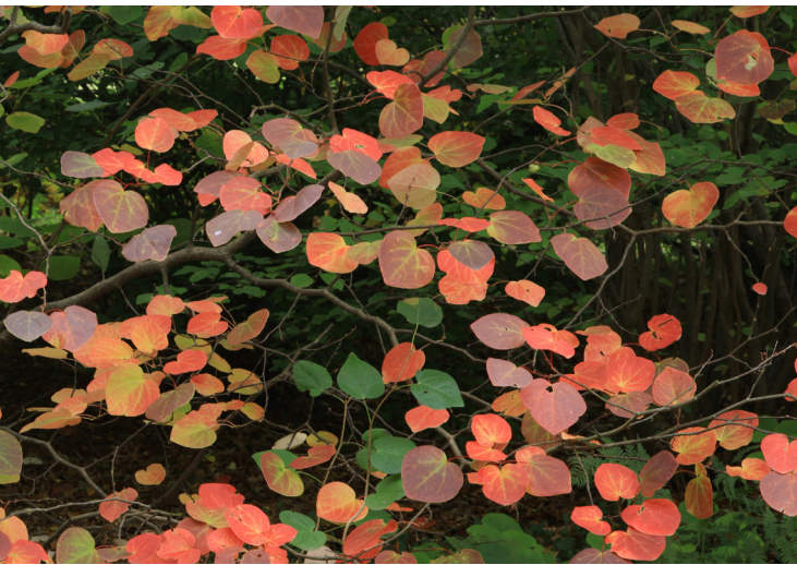
Fall color of Disanthus

While rare in the wild, D. cercidifolius can be found growing in mountain valleys in southeastern China and