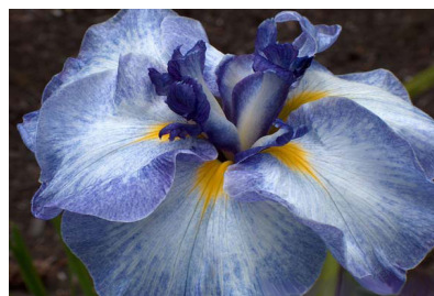
Rows left to right Iris sibirica ‘Banish Misfortune’ Iris ensata ‘Angelic Choir’ Iris germanica ‘Conjuration’ Iris germanica ‘Victoria Falls’ Iris ensata ‘Japanese Plum’ Iris germanica ‘Static Electricity’ Iris ensata ‘Cascade Crest’