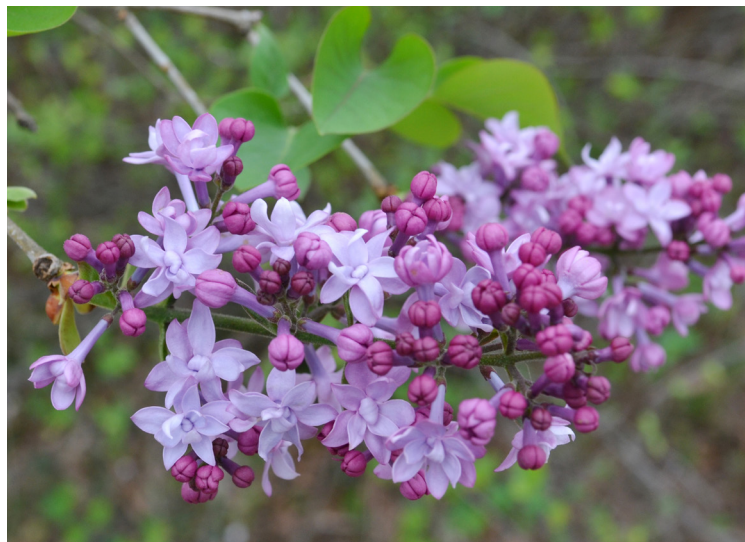
Syringa ×hyacinthiflora ‘Evangeline’.

Lilacs have been used in ornamental gardens since the 16th century and for good reason. Their spring and early–summer flowers are aesthetic and wonderfully fragrant. When the weather warms up in spring, come see the floral display and enjoy the fragrance.