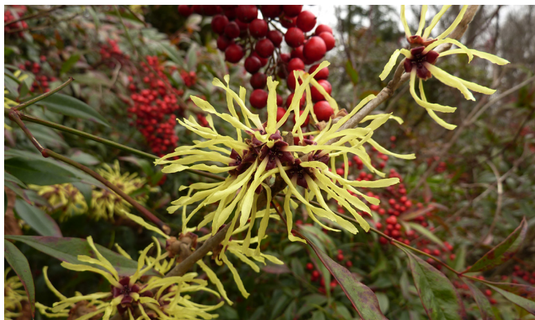
Hamamelis xintermedia 'Sunburst' (Witch Hazel) flowers in March at Brookside Gardens. Plant will be available at UDBG's 2017 Spring Plant Sale.

These are exciting times for the garden. It is very rewarding to see participants and partners so enthusiastic about the process and its potential for the future of the garden.