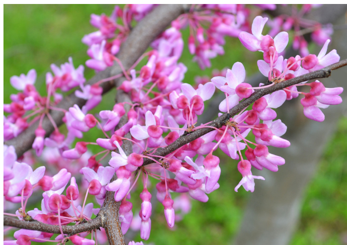
Cercis canadensis 'JN2' (The Rising Sun™ Redbud) flowers appear in spring. Plant will be available at UDBG's 2017 Spring Plant Sale.