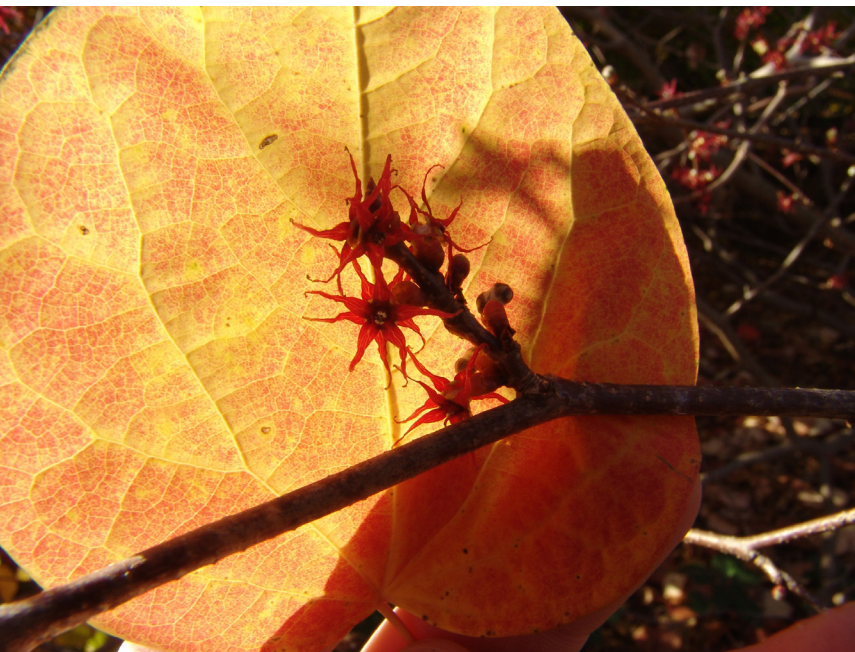
Fall color and flower of Disanthus

A special thanks to Yoko Arakawa of Longwood Gardens for providing Japanese translations.