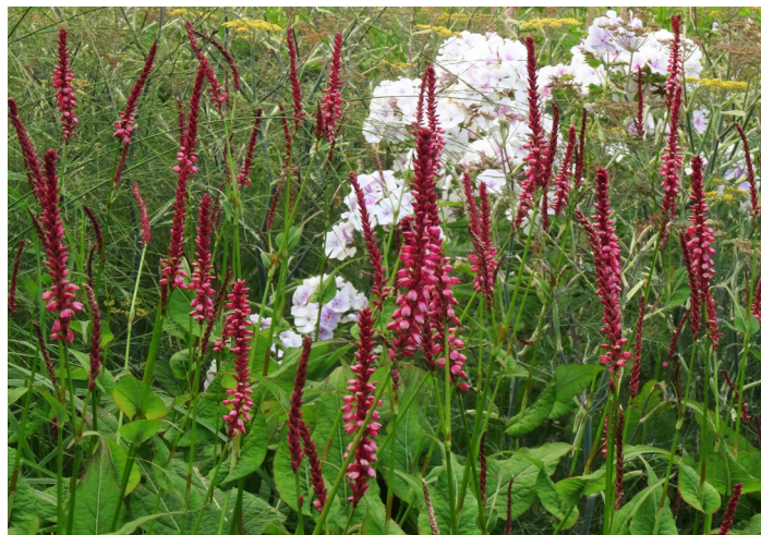
Persicaria amplexicaule 'Firetail'. Plant will be available at UDBG's 2017 Spring Plant Sale.