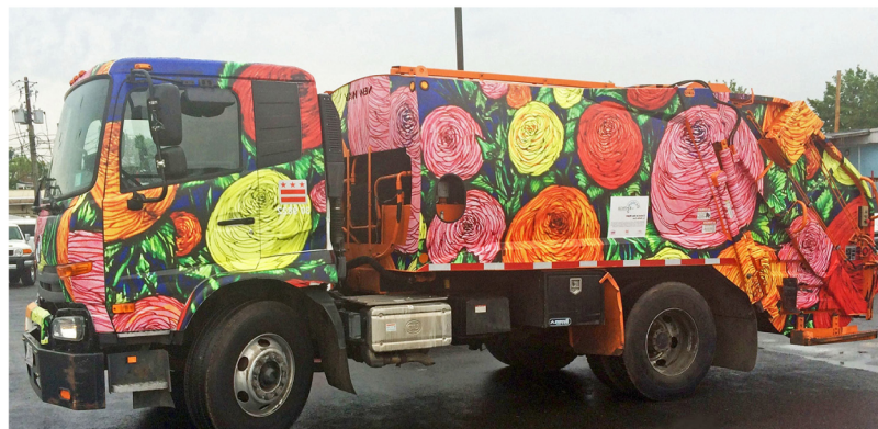
Commission on the Arts and Humanities DC Recycling Truck, 'Colors in the Night', driving out and about in Washington.